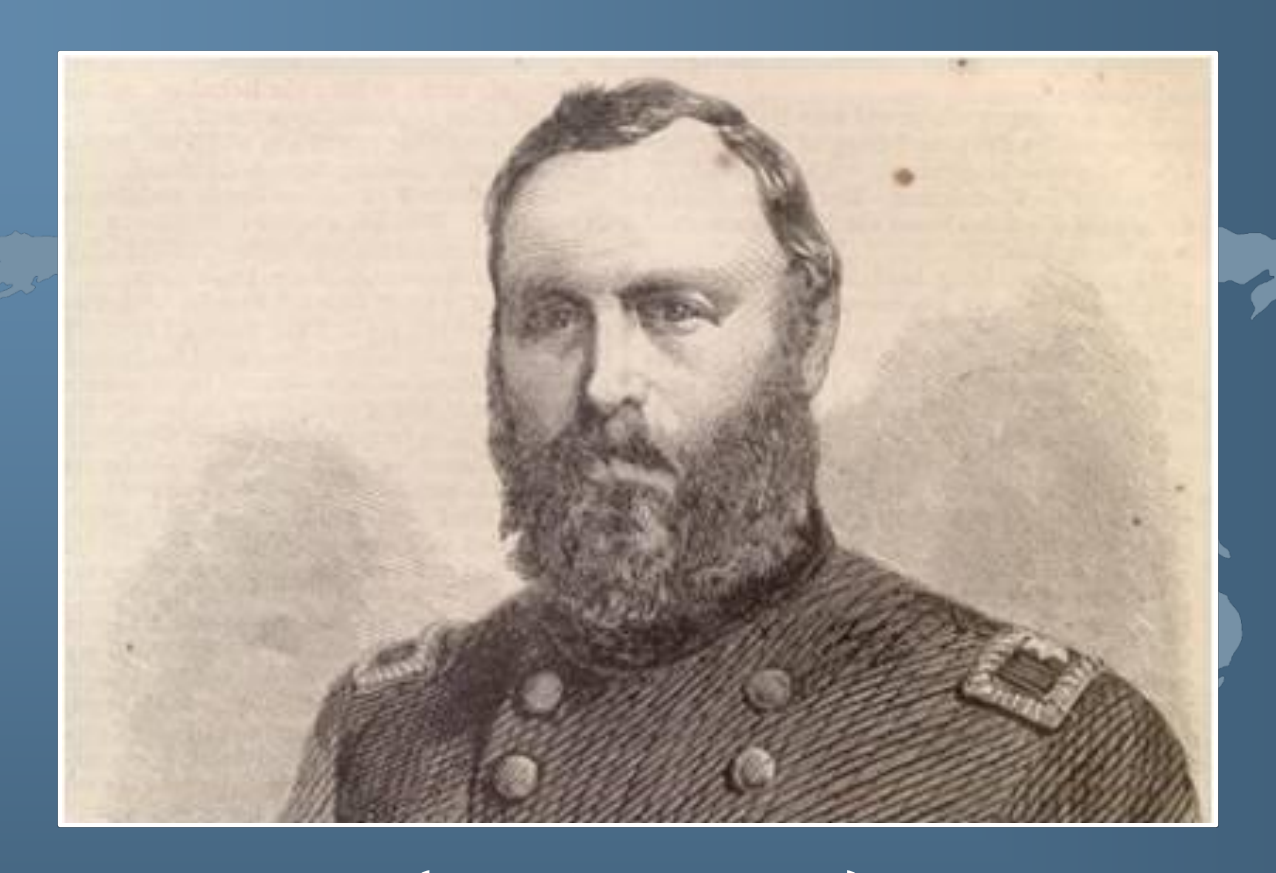
(1828 – 1900) William Hammond