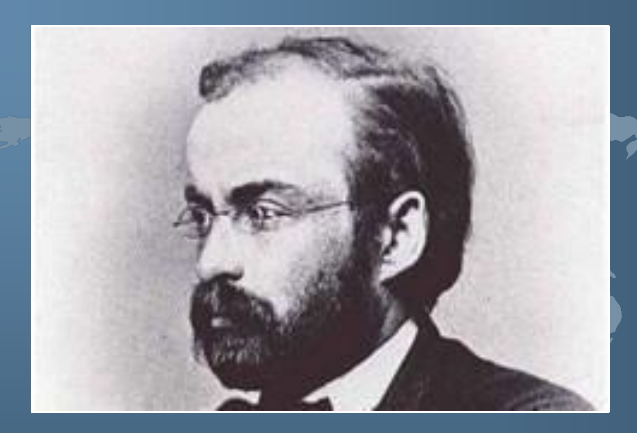
(1834 – 1900) Carl Lange, M.D.