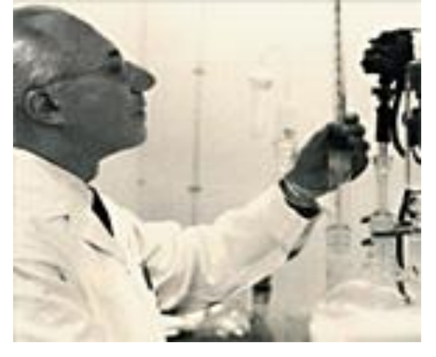
LEO STERNBACH DIED ON SEPTEMBER 28, 2005 AGED 97