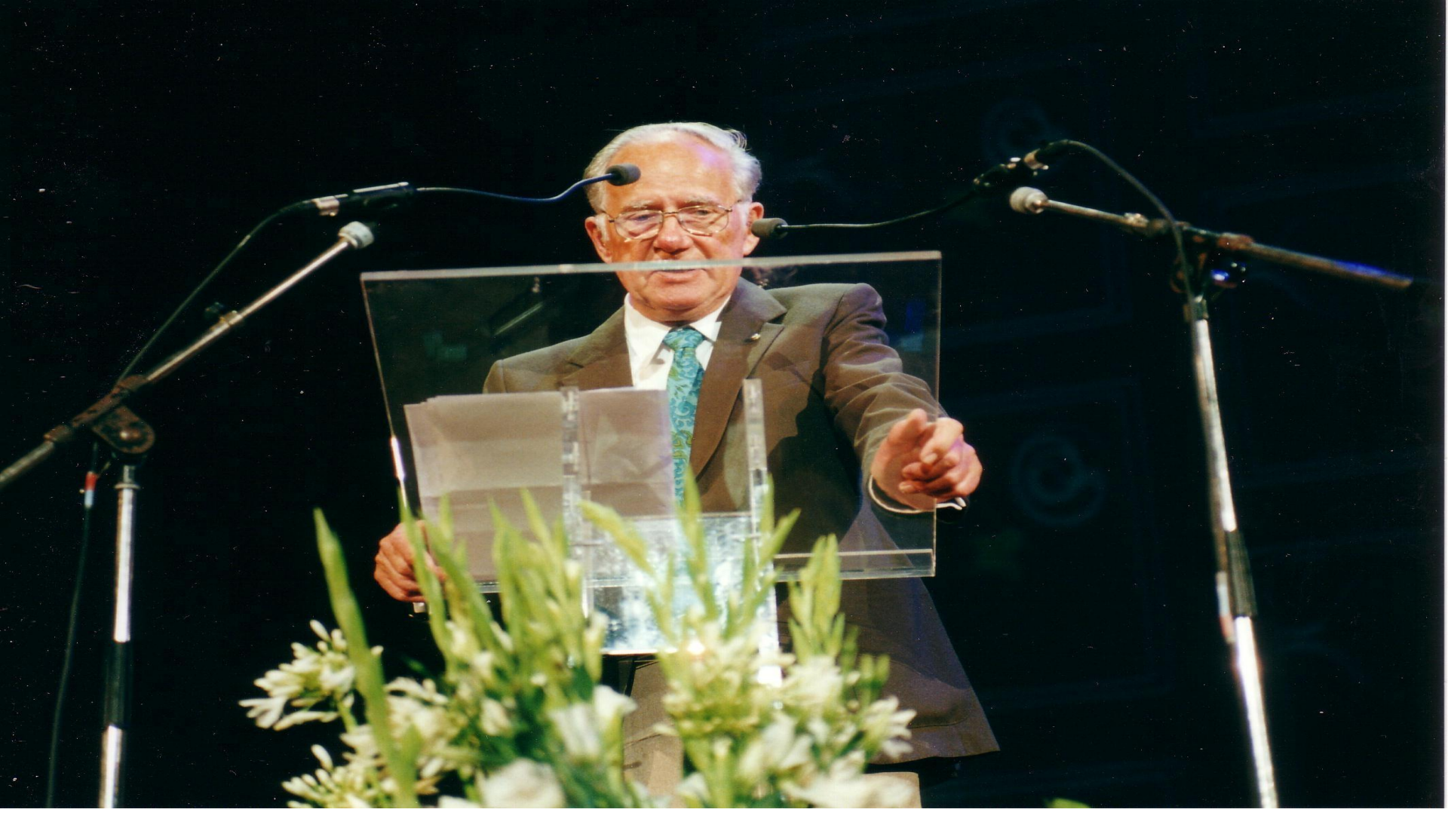
MOGENS SCHOU DIED ON SEPTEMBER 29, 2005 AGED 87